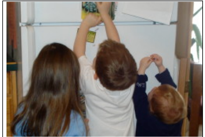
The membership committee has sent out a call for some additional snacks for Sunday mornings. The children have concurred.