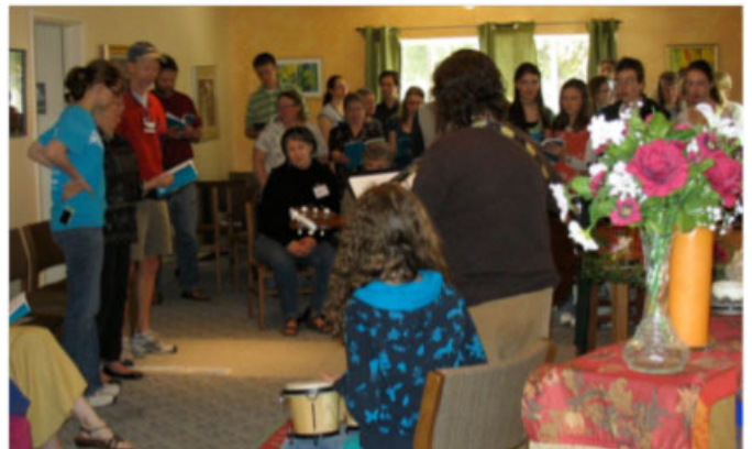
CVUU youth led an Earth Day Celebration service on April 25.

We are using the workbook: Money Talk: A financial guide for women. For details visit the FPW Blog: http://fpwusu.blogspot.com